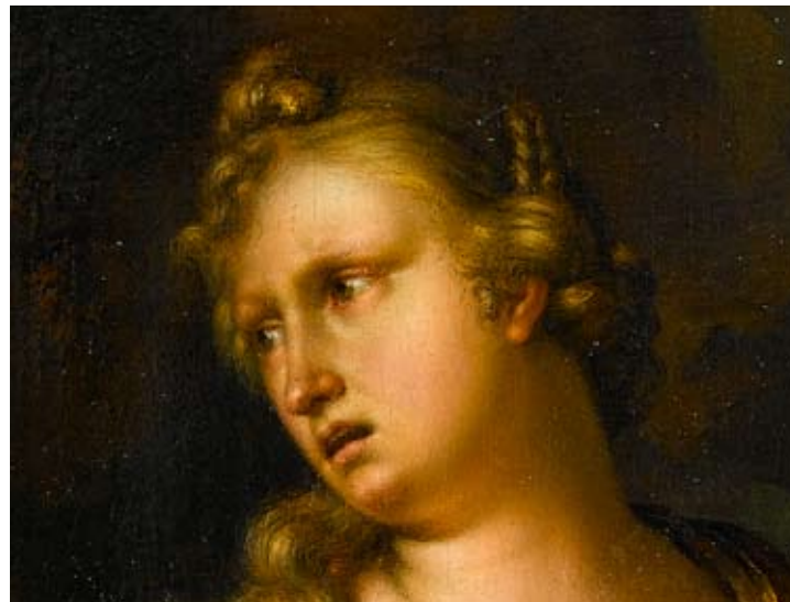
Willem van Mieris The Penitent Mary Magdalene (Detail)

skull, a vanitas symbol serves as a memento mori ; a reminder of the brevity of life and the contemplation of death.