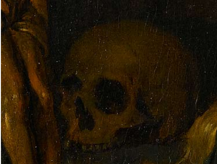
Willem van Mieris The Penitent Mary Magdalene (Detail)

Mieris was exceptionally gifted and the prices paid for his work were amongst the highest received for Dutch paintings in the seventeenth century. Frans van Mieris' superb skill as a painter is still recognised today, as exemplified by the 2008 sale at Sotheby's of his Young Woman in a Red Jacket Feeding a Parrot which sold for a record £3,200,000.