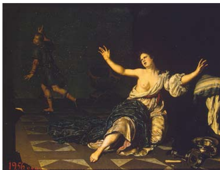
Willem van Mieris, Joseph and Potiphar's Wife , first half of the eighteenth century, The Hermitage, St. Petersburg; Acquired between 1763-1774 (Figure 1)

Mary Magdalene . Van Mieris, like Titian, has chosen to show Mary Magdalene as a troubled soul. In The Penitent Mary Magdalene she gazes out of the picture plane lost deep in thought, her left hand extended in bewildered exasperation. Both the present work and The Repentant Mary Magdalene show her alone in a grotto, a far reaching landscape in the background only further emphasising her isolation and solitude.