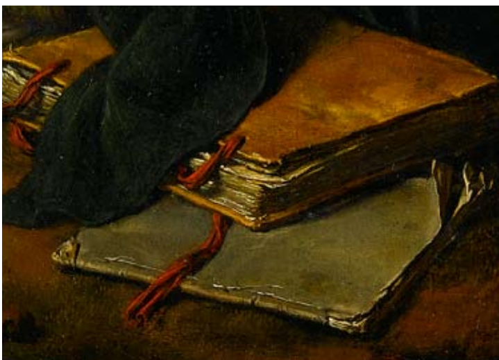
Willem van Mieris The Penitent Mary Magdalene (Detail)

Unlike his father, however, he also explored history painting, including religious scenes, subjects from Classical and Renaissance literature and pastoral themes. His female figures are frequently nude