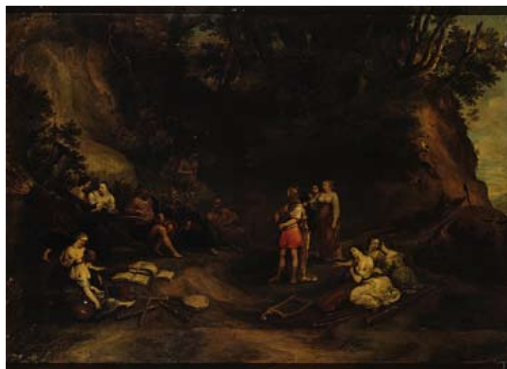
Hendrick van Balen I, The Judgement of Midas , The Hermitage, St. Petersburg; All-Union Society 'Antiquariat', 1933 (Figure 1)

Van Balen was a leading Antwerp painter who specialised in small cabinet pictures which often depicted mythological scenes. One of his larger scale mythological works is The Wedding Banquet of Peleus and Thetis . He travelled to Italy in 1592 where he may have met Hans Rottenhammer (1564-1625), who exerted a great deal of influence upon his style. In Antwerp, he collaborated not infrequently with his contemporaries, Joos de Momper II (1564-1635) (cat. no. 80) and Jan Brueghel I (1568-1625). Indeed, he often provided for Brueghel the figures for his landscapes and the fruit and flowers for garlands - evidence of his great skill in this area can be seen in the exquisite detail of a garland suspended by a hovering cherub in this present work. A testament to his artistic ability can be deduced from the pupils under his tutelage: in 1609, the year in which he was appointed dean of the Guild of St. Luke, van Balen taught Sir Anthony van Dyck (1599-1641) as well as Frans Synders (1579-1657).