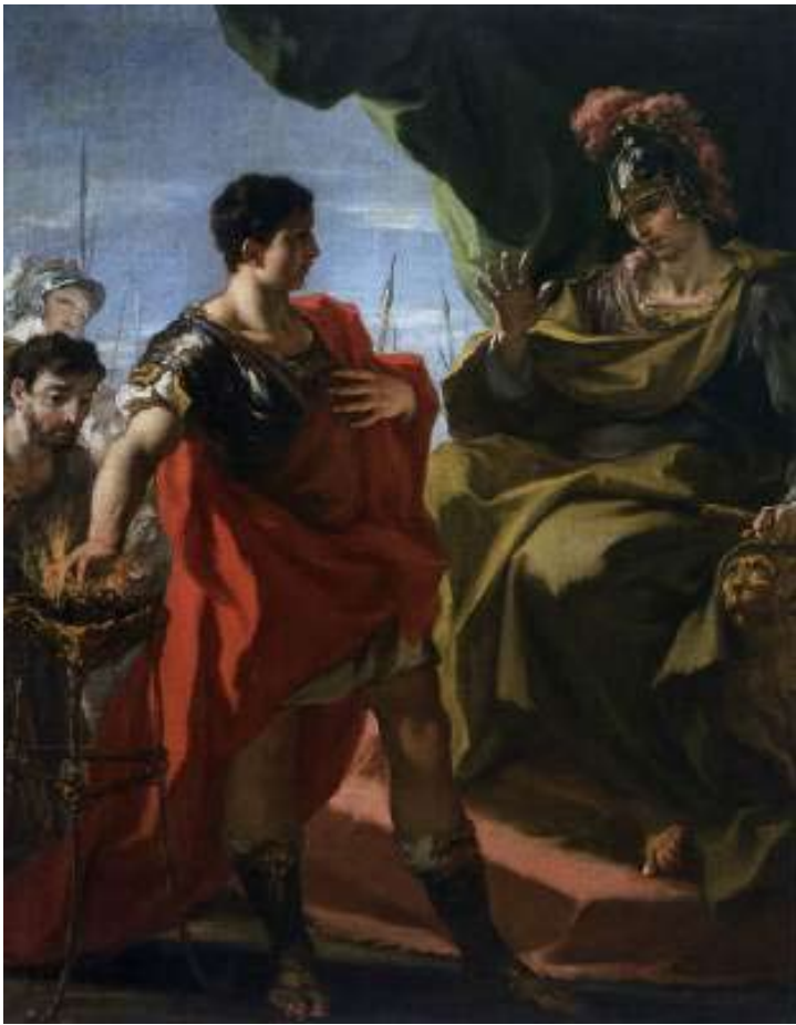
Giovanni Antonio Pellegrini, Mucius Scaevola before Porsenna , 1706-1708, Museo del Settecento Veneziano, Ca' Rezzonico, Venice (Figure 2)

turns away from the viewer in Young Hannibal Swears Enmity to Rome . In this mature work, Pellegrini blends the neo fifteenth-century style of Sebastiano Ricci (1659-1734) (see Inventory) with the chiaroscuro effects of Luca Giordano (1634-1705).