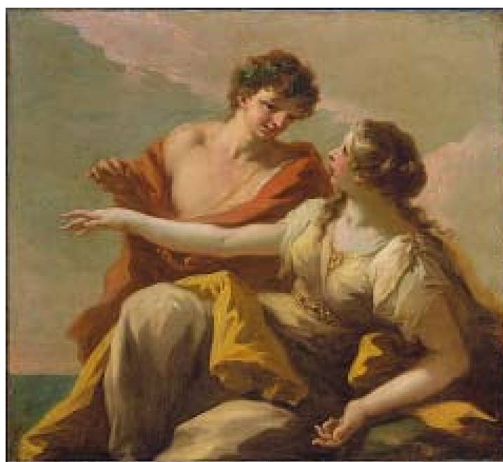
Giovanni Pellegrini, Bacchus and Ariadne , The Metropolitan Museum, New York (Figure 5)

In Venice, Pellegrini executed commissions in and around the city and it is believed that he painted Bacchus and Ariadne here, which although simpler in composition than Young Hannibal Swears Enmity to Rome , uses a similar