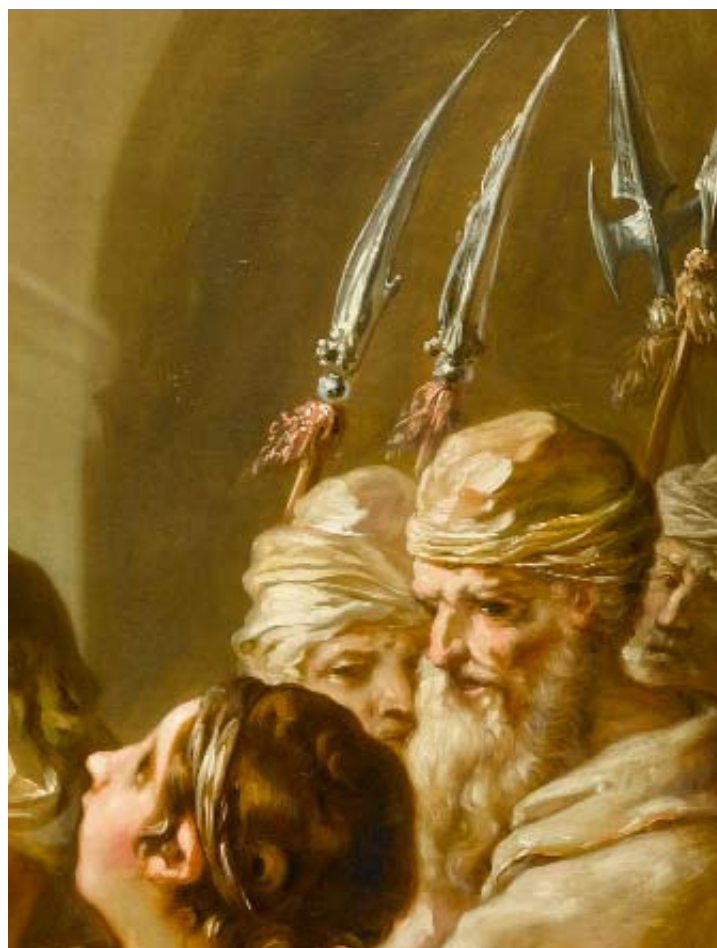
Giovanni Pellegrini, Young Hannibal Swears Enmity to Rome (Detail)