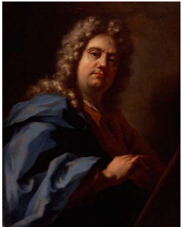
Giovanni Antonio Pellegrini, Self-Portrait , 1717, National Portrait Gallery, London (Figure 3)

Having trained under P. Pagani (1661-1716) in Venice, Pellegrini was invited to England in 1708 by the British ambassador to Venice, Charles Montagu. Whilst there he decorated the stairwell of Montagu's London home in Arlington Street, which has since been destroyed. The following year, Pellegrini, along with Marco Ricci (1676-1730) who had also been invited over to England by the ambassador, painted the set designs for Alessandro Scarlatti's opera, Pirro e Demetrio and for Giovanni Bononcini's Camilla . That same year he received a commission from Charles, the 3 rd Earl of Carlisle to paint the cupola, staircases and entrance hall of Vanburgh's magnificent Castle Howard in North Yorkshire which was largely destroyed by fire in 1941. Employing the fashionable genre of mythological and allegorical paintings, Pellegrini created