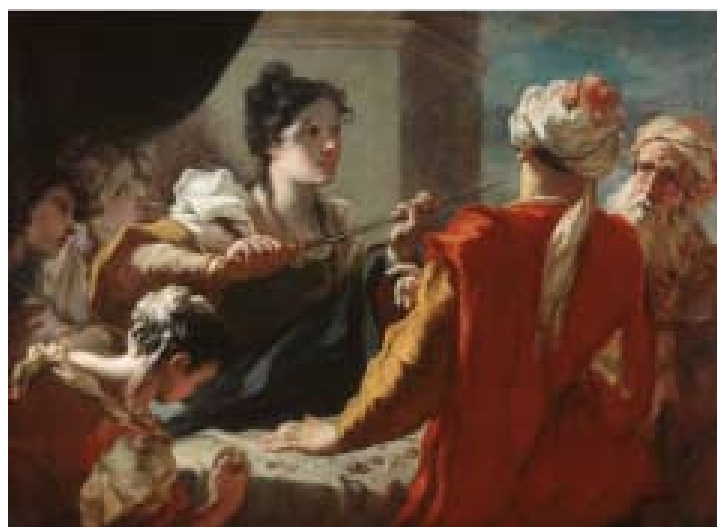
Giovanni Antonio Pellegrini, Achilles Discovered with the Daughters of Lycomedes , The Spencer Museum of Art, Kansas (Figure 1)

The vivid cloaks of the three protagonists in Young Hannibal Swears