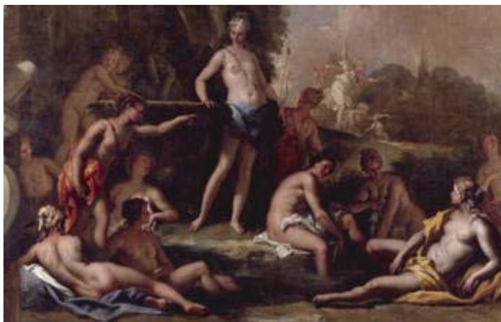
Giovanni Antonio Pellegrini and Sebastiano Ricci, Diana and her Nymphs Bathing , 1713-1715, Narford Hall, Norfolk, (Detail from the side wall of the main staircase) (Figure 4)

Pellegrini was particularly successful in England and through his acquaintance with Sir Godfrey Kneller he assisted in the foundation of Kneller's Academy in London in 1711 and also became a director. Pellegrini even submitted designs for the dome of the new St. Paul's Cathedral and his design is said to have been Sir Christopher Wren's (1632-1723) preferred choice. In the end Pellegrini was pipped to the post by the English painter Sir James Thornhill (1675-1734) who received the commission instead. This anecdote in itself goes some way to demonstrate the great esteem in which