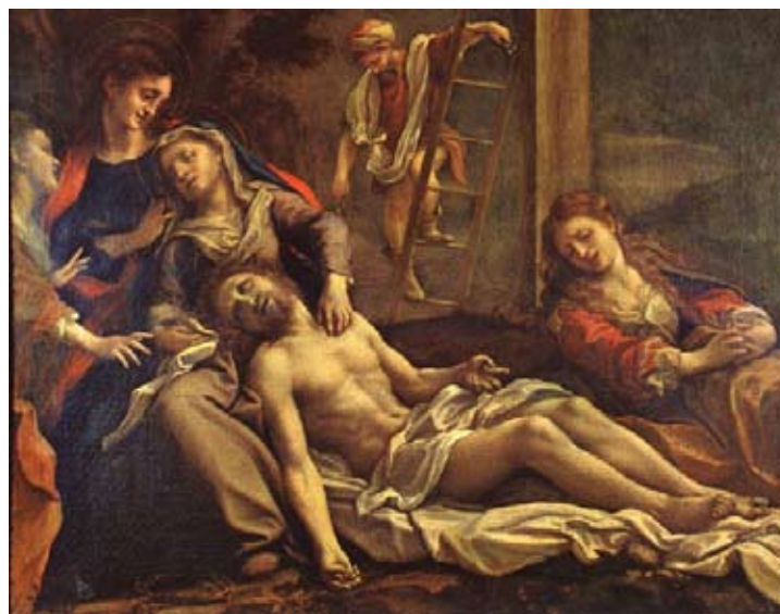
Correggio, Deposition from the Cross , 1525, Galleria Nazionale, Parma (Figure 3)

Whilst a great deal of Spranger's later output gave prominence to the playful subject matter popular at the imperial courts of Prague and Vienna, see figs. 4 and 5, his Adoration of the Kings , see fig. 2, is alike in its religious subject matter to the present work. It is interesting to note the extensive stylistic differences in the course of the intervening twenty years between the execution of The Sufferings of Christ and his Adoration of the Kings . The mannerist style that pervades The Sufferings of Christ has been replaced here by a distinctly more courtly and artificial atmosphere, showing influences of El Greco in the figures of the Virgin and Child. The composition is carefully arranged so that the two kings in the foreground are mirror images of each other just as their pageboys, too, imitate their balletic stance. There is none of this in Spranger's more serious depiction of Christ's suffering in all its intensity. Similarities can be identified in the richly vivid colours of the cloaks adorning the three kings and those worn by the two angels in the left hand corner of The Sufferings of Christ .