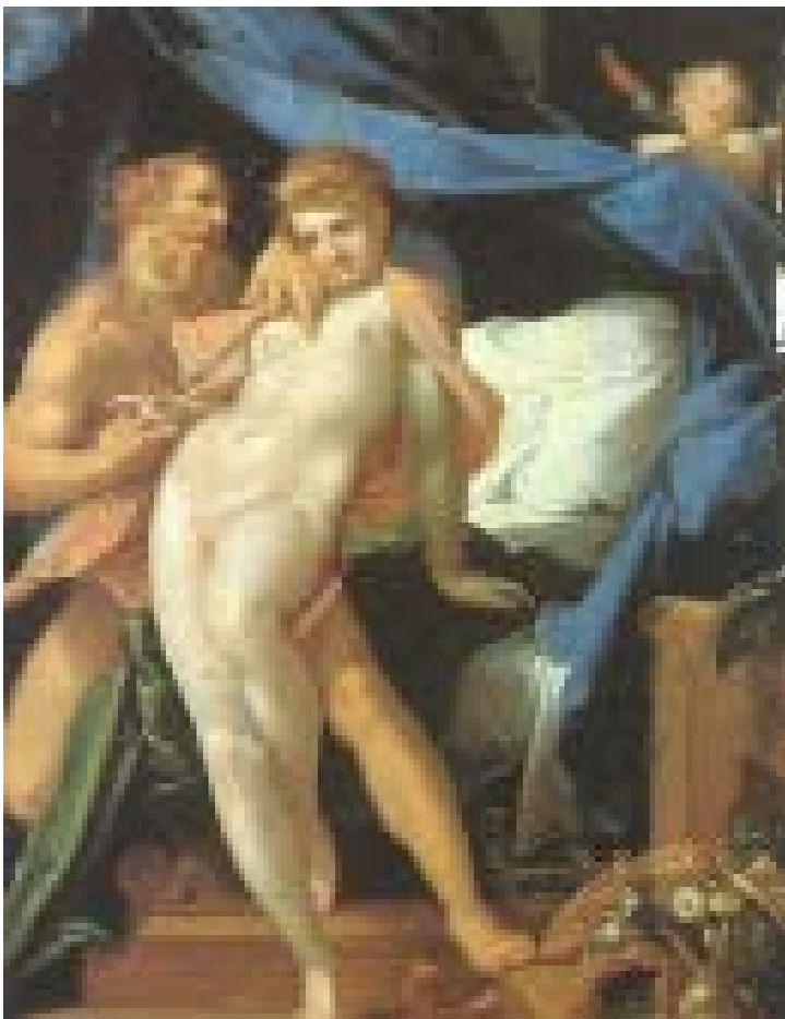
Bartholomäus Spranger, Maia and Vulcan , Kunsthistorisches Museum, Vienna (Figure 4)

of S. Maria della Steccata. Whilst in Italy, the works, particularly, of Correggio (?1489-1534), see fig. 3, and Parmigianino, made a deep impression on him.