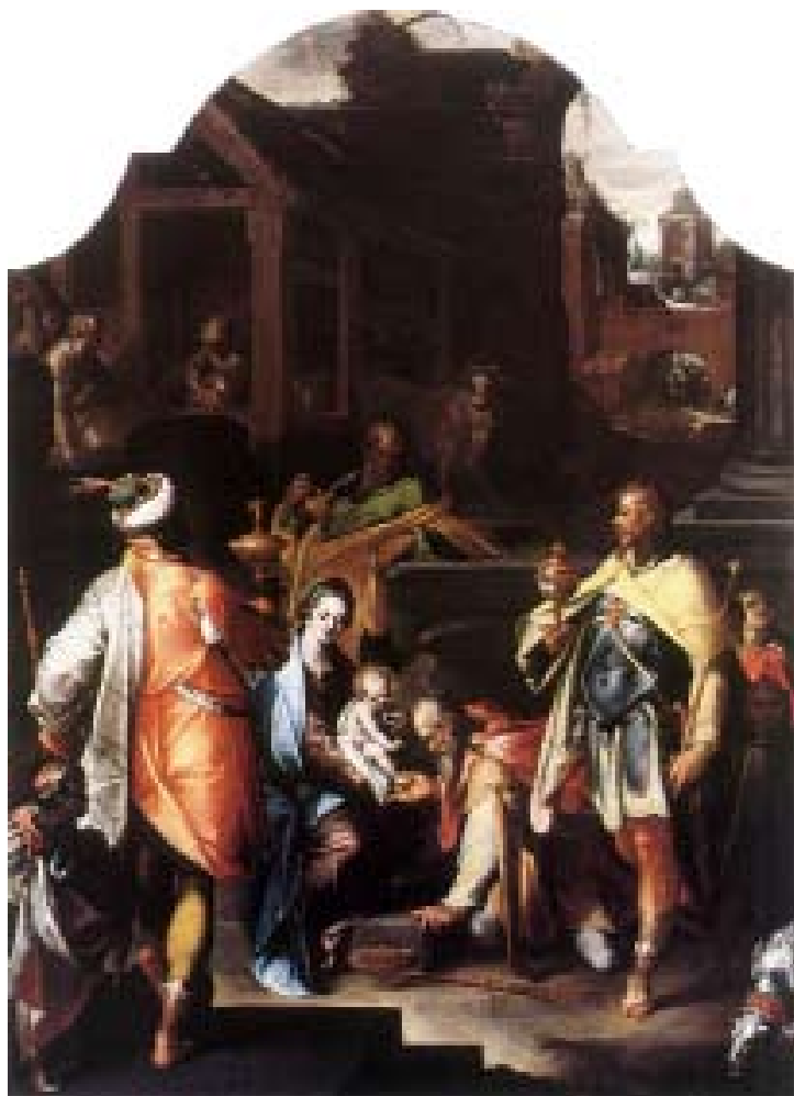
Bartholomäus Spranger, Adoration of the Kings , c.1595, The National Gallery, London (Figure 2)

The climactic moment of the Passion story is the crucifixion itself. Paintings of this subject were usually intended to foster meditation on Christ's self sacrifice and this present work is no exception. Its relatively small size