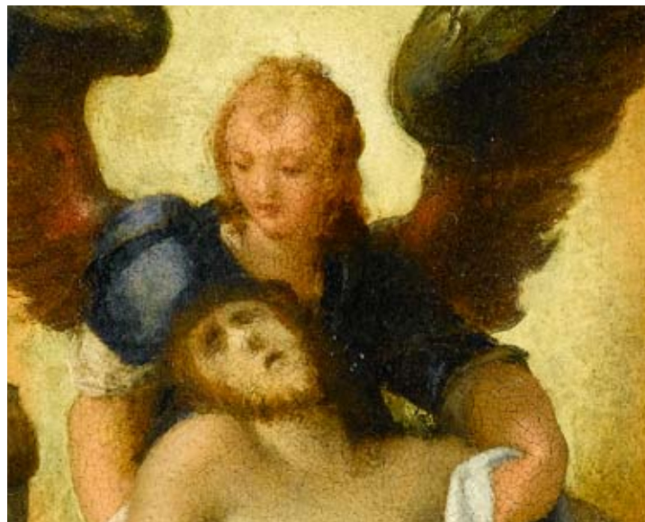
Bartholomäus Spranger, The Sufferings of Christ (Detail)

Spranger is renowned for his unique ability to fuse his native Netherlandish tradition with the Italian Mannerist influences of his extensive European travels. Along with his fellow countrymen, Hans von Aachen (1552-1615) and Joseph Heinz I (1564-1609), Spranger was one of the most important artists at the court of Rudolf II in Prague. Early in his career he travelled to Italy, studying fresco painting in Milan and then, in the spring of 1566, he worked in Parma as an assistant to Bernardino Gatti (c.1495-1576) where he painted the dome