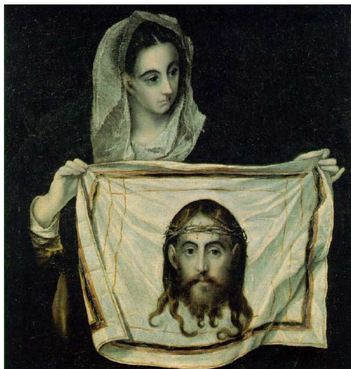
El Greco, Saint Veronica Holding the Veil , c.1580, Museo de Santa Cruz, Toledo (Figure 1)