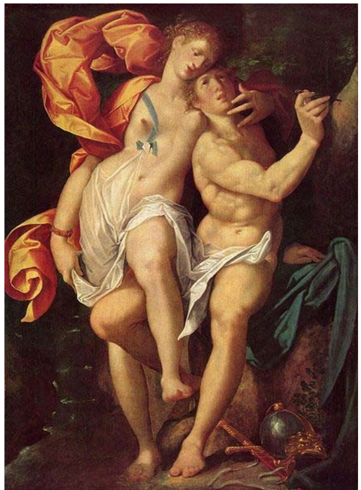
Bartholomäus Spranger, Angelica and Medor , 1600, Alte Pinakothek, Munich (Figure 5)