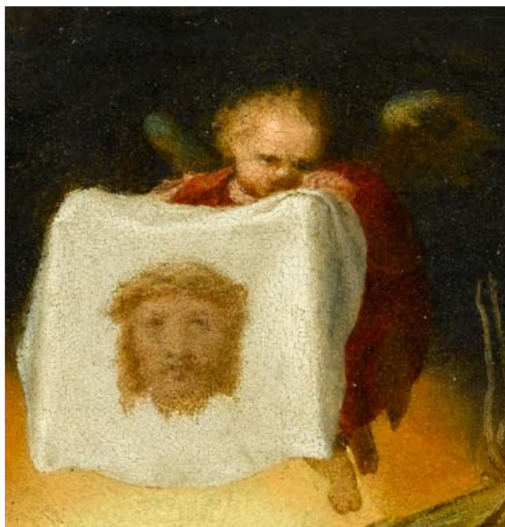
Bartholomäus Spranger, The Sufferings of Christ (Detail)

and lengthened subjects that dominate Parmigianino's work. The angels detailed here represent a supreme example of Spranger's skill at combining the Flemish and Italian styles. The iridescent wings of the central angel resemble those of birds and are rendered in a typically Flemish naturalistic way. And yet, the wings of the standing angels to the left of the composition are far more reminiscent of early Renaissance Italian painters such as Fra Angelico (c.1395/1400-1455). The little putto hovering above and bearing the sudarium of St. Veronica, has wings that seem almost like peacock's feathers. The cloth which he holds aloft is an allusion to the cloth which Veronica, a pious woman of Jerusalem, gave to Jesus on His way to Calvary. Moved to pity as she witnessed Him carrying His cross to Golgotha, she gave Him her veil so that He might wipe his forehead. Jesus accepted the offering and when He returned it to her, His face had miraculously imprinted itself onto it. Veronica's sense of wonderment is beautifully depicted in El Greco's (c.1541-1614) Saint Veronica Holding the Veil (fig. 1).